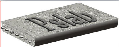
Prestressed Precast Half Slab